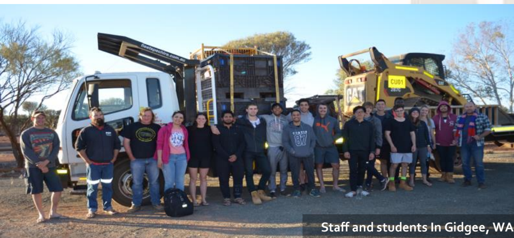
Staff and students in Gidgee, WA