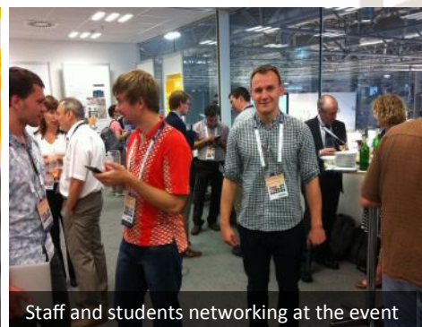
Staff and students networking at the event