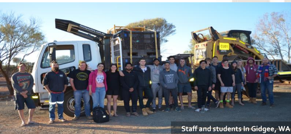
Staff and students in Gidgee, WA